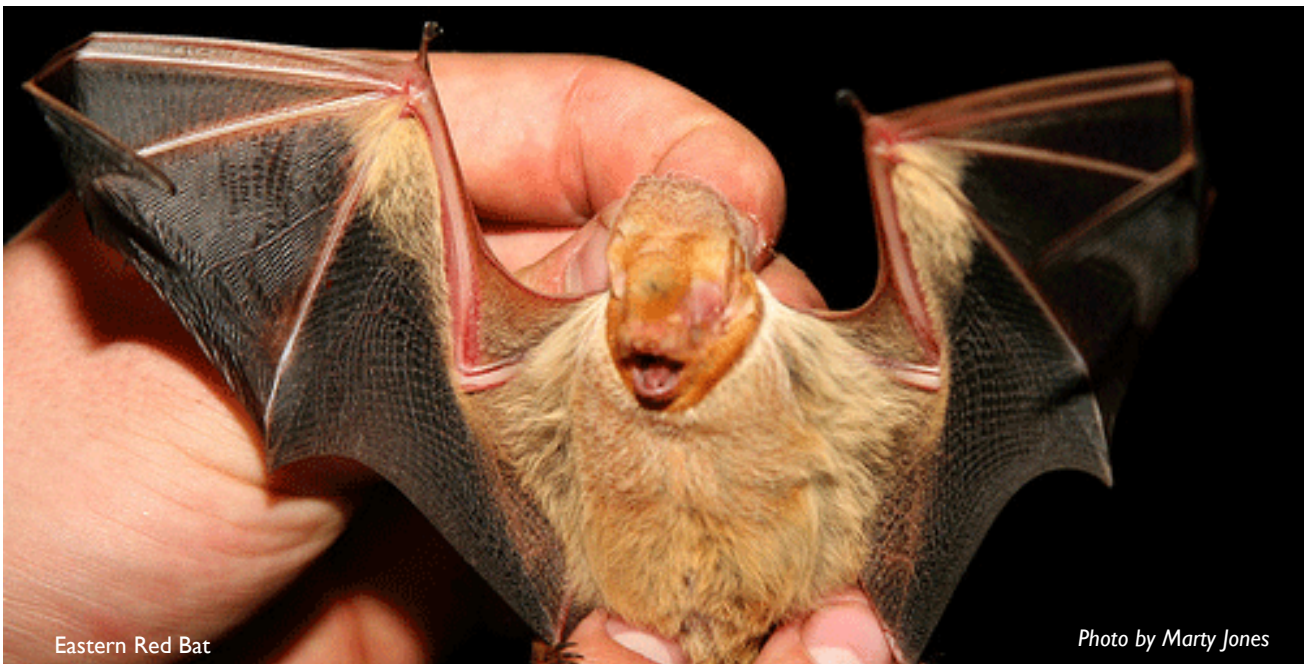
Eastern Red Bat

I'm always surprised when kids don't know what a squirrel is. They have some idea – a cartoon idea – of chipmunks, but sometimes they think chipmunks are baby squirrels.