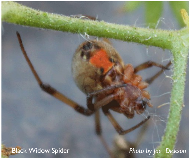
Black Widow Spider