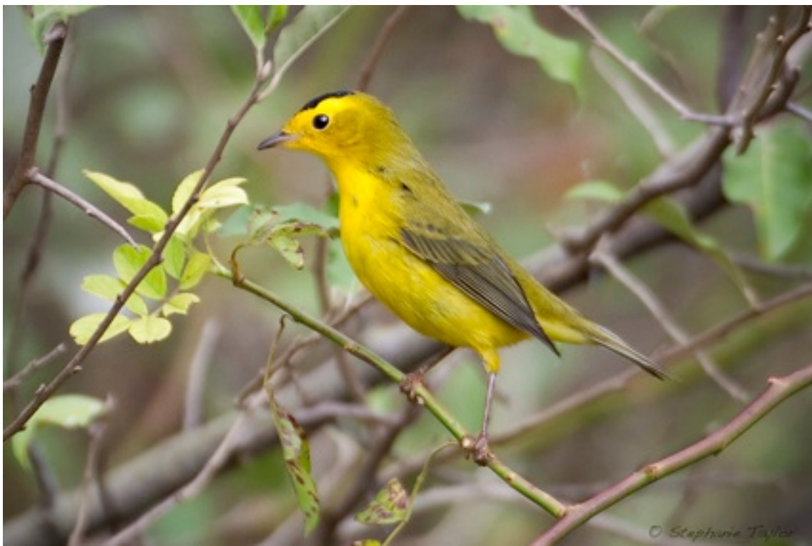
Wilson's Warbler