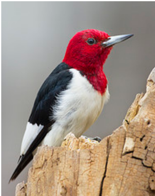
Red-headed Woodpecker, Vigo County, Indiana March 10, 2013.