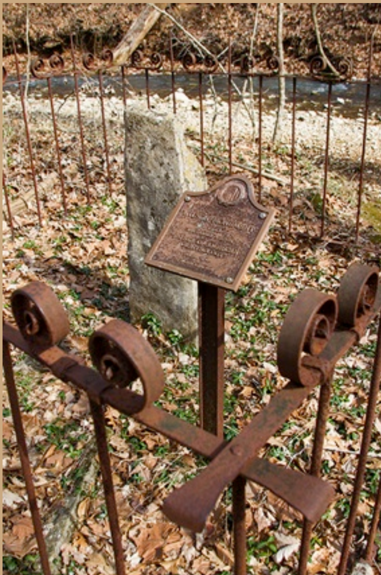
Above: Photo of the monument. A closer look at the stone reveals a hand carved piece of limestone with an inscribed likeness of Alexander Wilson with his date of his birth and death.

Coincidentally, Alexander Wilson and George Ord are buried next to each other in the Philadelphia cemetery. He is also honored in his home town of Paisley, Scotland with a memorial and a statue. It is inscribed "Remember Alexander Wilson 1766-1813. Here was his boyhood playground."