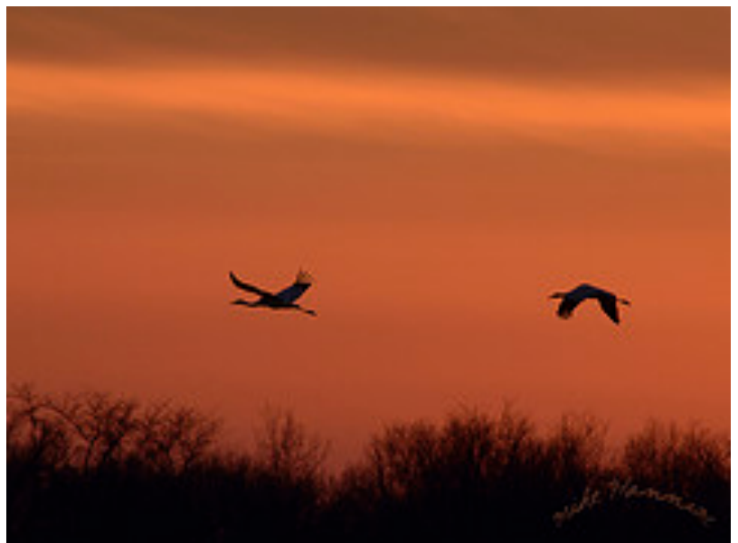
Whooping Cranes, Bee Hunter Marsh Greene County, Indiana, February 2013.