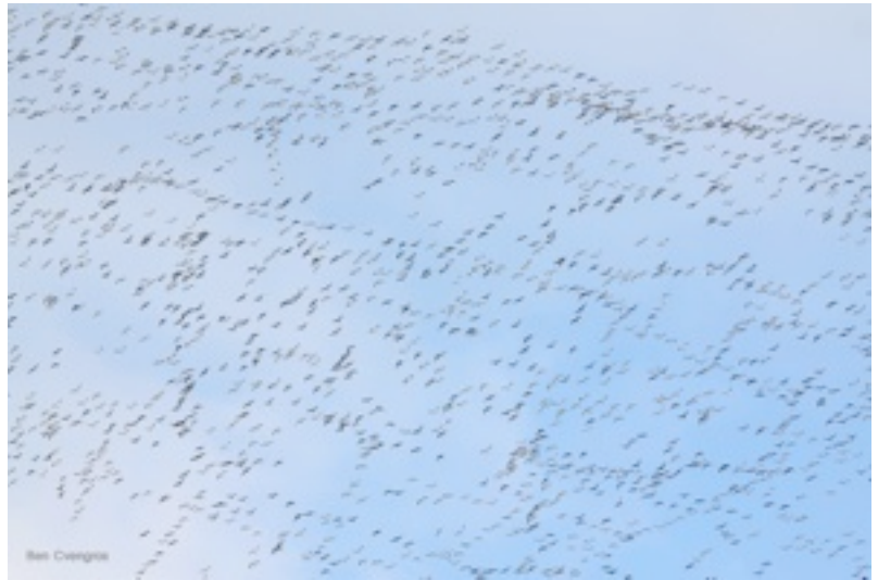
Snow Geese, An estimated 5,000 were seen at Universal Mine, Vermillion County, Indiana, Feb 4, 2013.